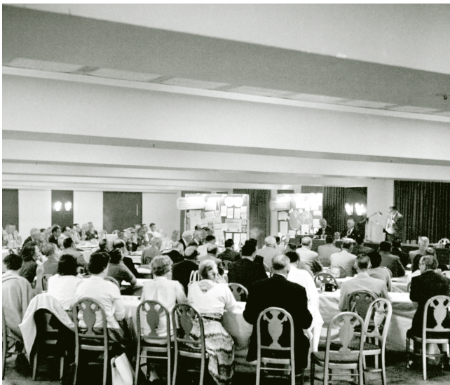
A session of the 1955 General Service Conference, held at Hotel Jefferson, St. Louis, Missouri. This Conference was a part of the International Convention and the only Conference held outside of New York State. The second edition of the Big Book was introduced and the Third Legacy of Service was accepted.

Alcoholic With Special Needs" will be reviewed by the Treatment Facilities/Special Needs-Accessibilities Committee.